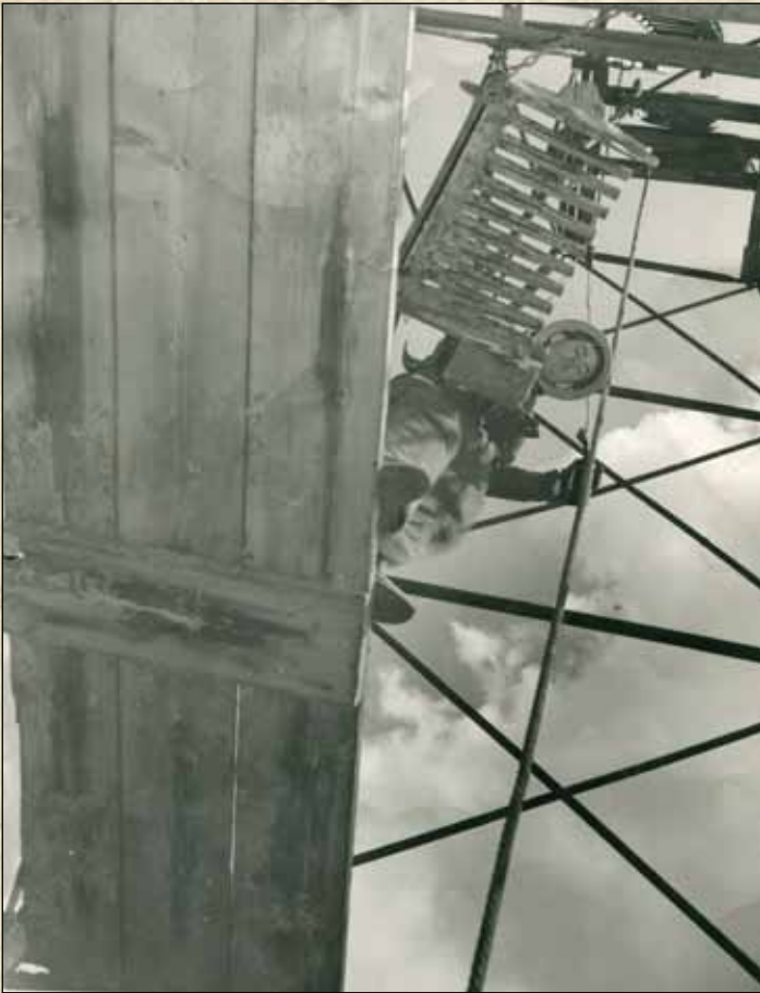
1950 photograph of Joe Scheck pulling rods in the Roback field south of the town of Gorham.

Regional Index Map showing the location of the Gorham oilfield in Russell County. Interstate Highway 70 (I-70) and the town of Gorham are reference points shown on succeeding maps.