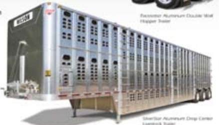
Overhaul Aluminum Drop Center Lumber Trailer