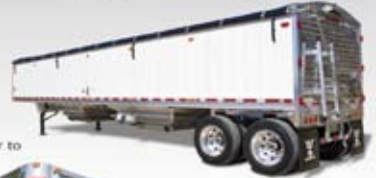
Patrol Aluminum Double Wall Hopper Trailer