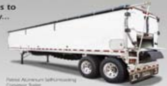
Patrol Aluminum Self-Loading Converter Trailer