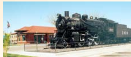
Lamar Santa Fe Railroad station and engine No. 1819.

Big Timbers also has on display a number of documents and artifacts concerning the infamous 1928 robbery of the First National Bank in Lamar by the notorious Fleagle Gang. This was the first case where the FBI used a single