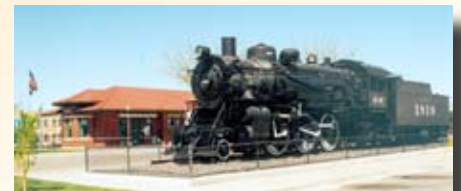
Lamar Santa Fe Railroad station and engine No. 1819.

Big Timbers also has on display a number of documents and artifacts concerning the infamous 1928 robbery of the First National Bank in Lamar by the notorious Fleagle Gang. This was the first case where the FBI used a single